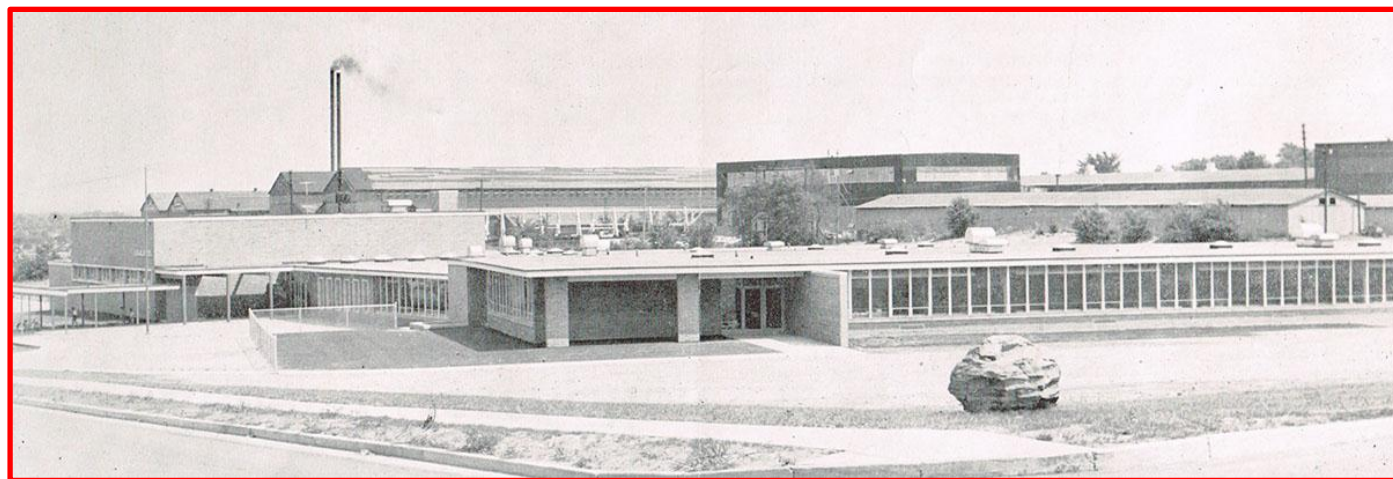
Morgan Elementary School